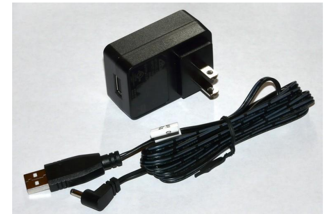
PN 11663 Power Supply 5V 2.1A and PN 10734 Power Cable 1.35mm ID/3.5mm OD x USB A 6 ft.

The illuminator may be powered by plugging the cable into the power supply provided, or into a suitable USB port on a computer or other device.