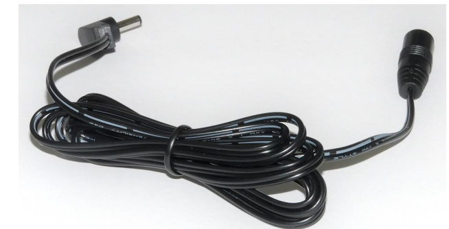
PN 11000 Power Cord Extension 1.35mm ID x 3.5mm OD RA plug to jack 6 foot. (use if needed for more length)

Power supplies are subject to substitution without notice due to availability issues and changes in regulations.